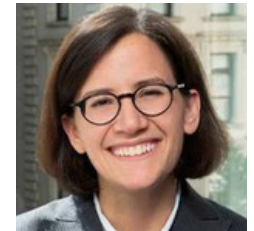
Judge Ana Reyes

United States District Court, District of Columbia